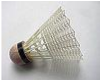
A shuttlecock with a plastic skirt