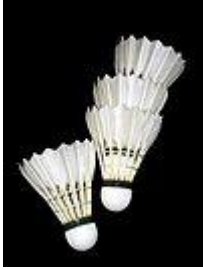
Shuttlecocks with feathers